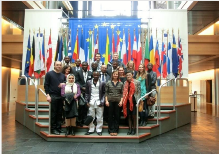
Den Haag International Criminal Court International Court of Justice