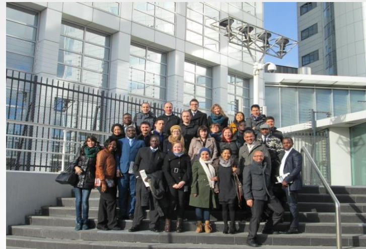
Strasbourg European Court of Human Rights European Parliament